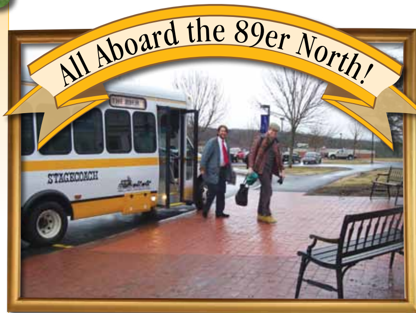
Staff members arrive at the Vermont Technical College campus in Randolph Center via Stagecoach's new 89er North.